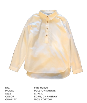
NO. MODEL SIZE COLOR QUALITY