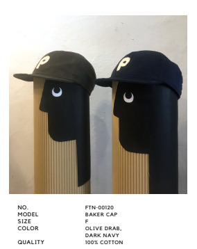
NO. MODEL SIZE COLOR QUALITY