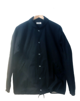
FTN-00320 FACTORY COACH JACKET S, M, L, XL KHAKI, DARK NAVY 100% COTTON NO. MODEL SIZE COLOR QUALITY